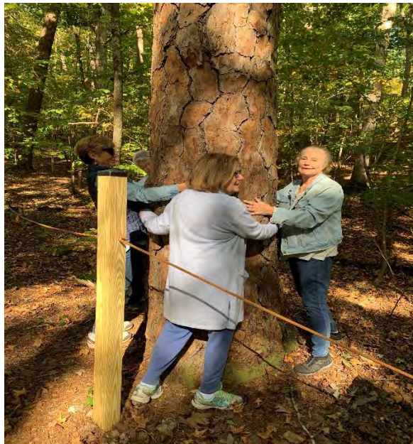
Hugging a short-leaf pine always makes one feel better!