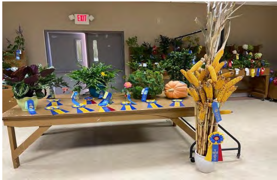
Fair Award Table Display