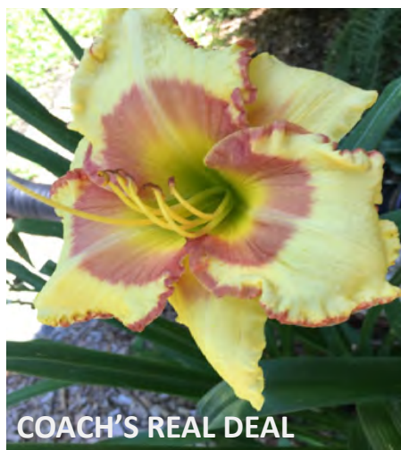
COACH’S REAL DEAL