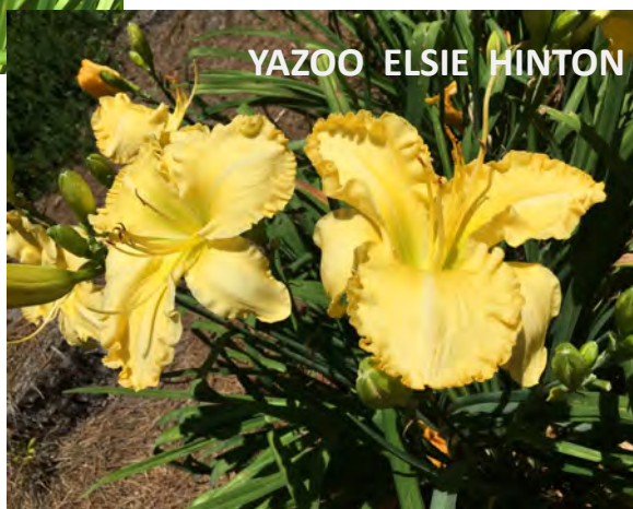
YAZOO ELSIE HINTON