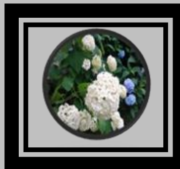
White and blue hydrangeas will be the color scheme for the 2014 2015 year.

Townview Garden Club is responsible for paper supplies for July, 2014. Camellia is scheduled for refreshments for the August meeting. The new rotation for the garden center will be in the notebook changes.