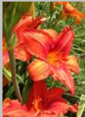
(L) Hemerocalis 'Siloam Double Classic'(R) Hemerocalis 'Alabama Jubilee'

“Encourage Conservation, Educate Youth, Enjoy Garden Club”