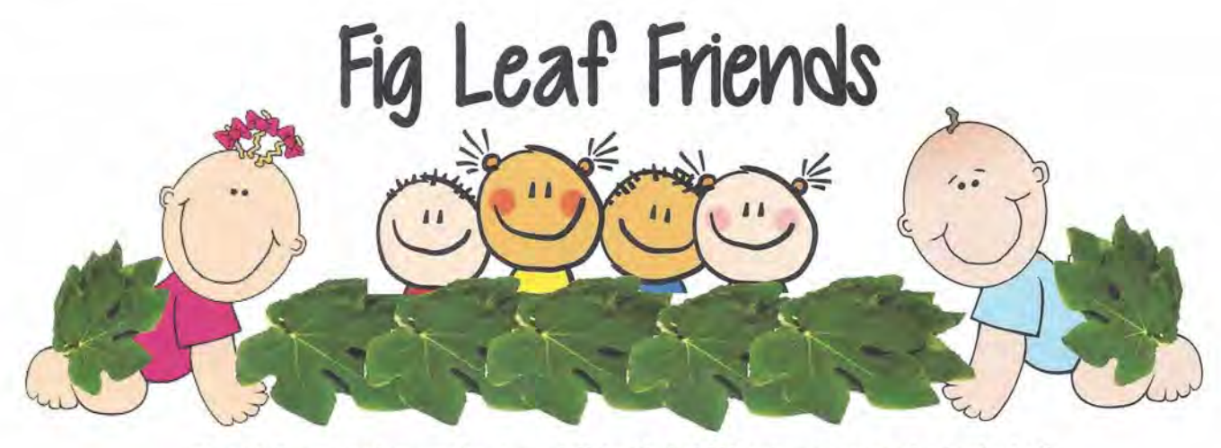
Floyd County has a foster child crisis! What can you do to help?

With 330+ children currently in foster care [1/3 under 5 years] from Floyd County homes, we have one of the highest numbers per capita in care among Georgia's 159 counties. Mental health issues, poverty, homelessness, incarcerated parents, substance abuse and child neglect are underlying issues for children going into foster care. Until the children can be safely returned to their parents, a relative can take them, or they are adopted, they will remain in foster care. The Restoration Rome collaboration of faith-based services houses agencies assisting these children and their birth and foster families by providing them with after school tutoring, meals, clothing, supervised visits and by housing groups offering medical, dental, mental health care and substance abuse treatments. Reconciliation and restoration of families, when possible, is the primary purpose of the agencies.