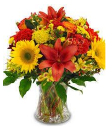
Article from "Gardening Month by Month"

friend this month. shining brightly one day and then hiding behind the cloud for days on end. This is the traditional time for taking cuttings from tender perennials such geraniums and as fuchsias. Cuttings taken now will root more quickly than later when the weather is even cooler.